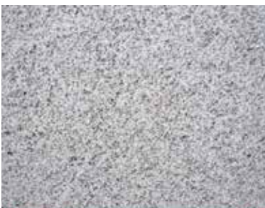
Brazilian Luna Pearl