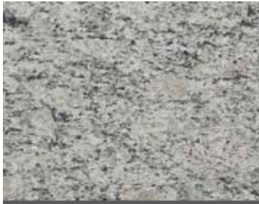
Santa Cecilia Light